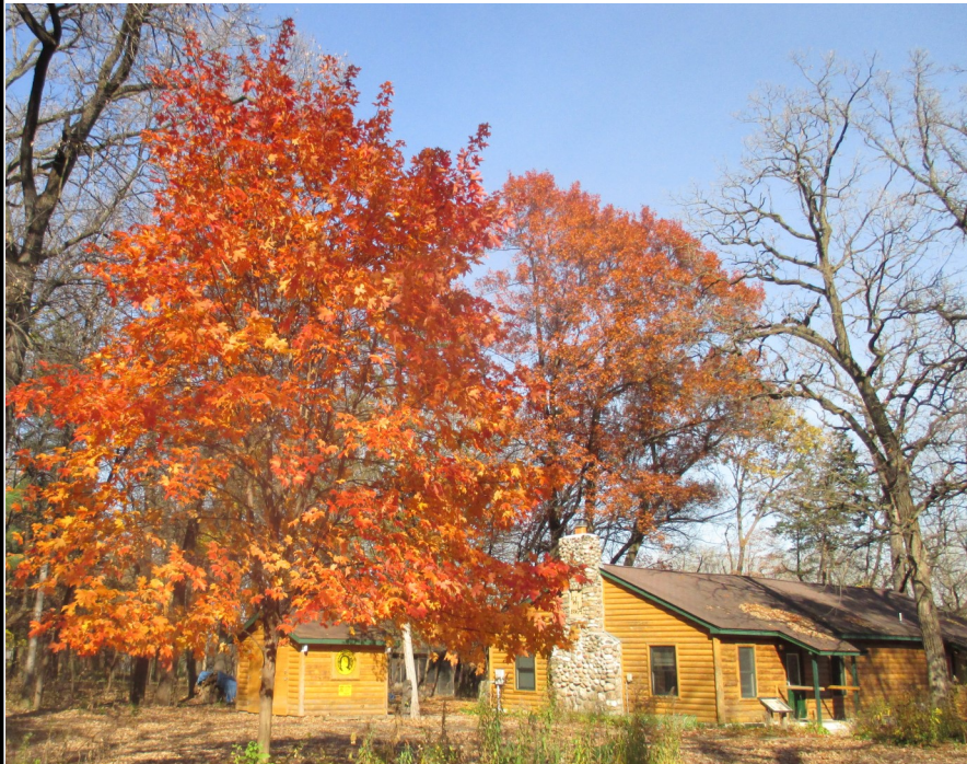
Mother Nature at her best at the Club House.