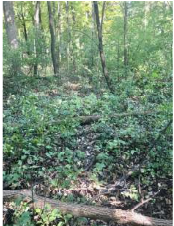
Cover It Up Study Area

Meanwhile, out on our Banfill Island, the fall flood waters proved too high to carry out the planned buckthorn eradication projects this year. The National Parks Service will be coming instead this coming spring to treat the worst infestation on the southeast side of the island. A science class from Champlin/Park High School had hoped to take a field trip to Banfill Island this fall to pull buckthorn in a part of it. But that too had to be postponed to another time due to the record high water.