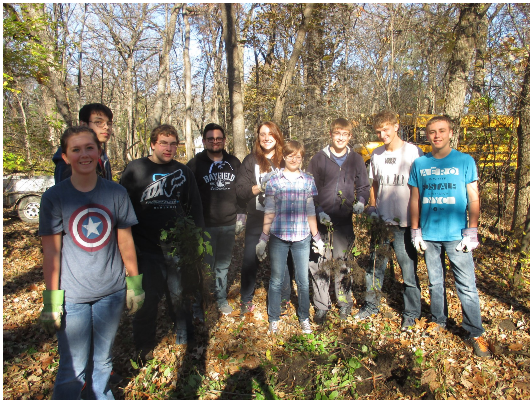
Thank you Champlin Park H.S. Outdoor Adventure students.